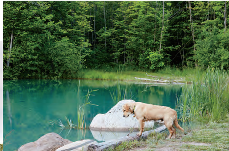
plywood. A quartet of black Tom Dixon Beat lights hangs overhead. The 10-acre property offers ample terrain for the family to explore. Otis examines the pond, which was deepened to 20 feet and stocked with trout (right); Cooper, 11, paddleboards toward an outbuilding that contains a sauna (below).