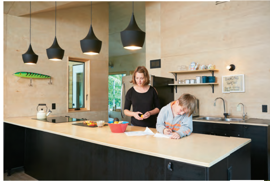
The east-west breezeway divides the home into nearly equal halves: 700 square feet for bedrooms, a bathroom, and the laundry, and 650 square feet for everything else. To focus attention on the back-country wilderness, the team relied